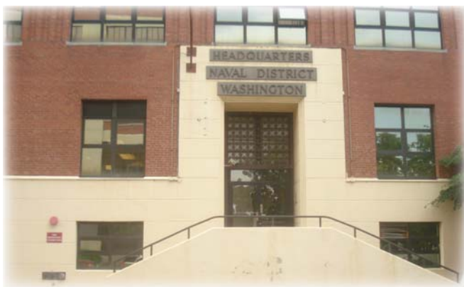
Washington Navy Yard B200 Five-Story Building Exterior

The following projects are examples of how John J. Kirlin, LLC has become a valuable partner in design-build construction.