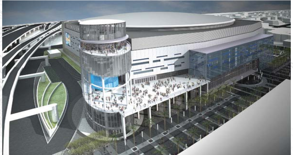
Orlando Events Center Rendering

Our experience and capacity will prove invaluable when it comes to the challenge of the Orlando Event Center's fast-track schedule. In April 2009, our crew hit the ground running to accomplish mechanical rough-in within a tight 10-month timeframe.