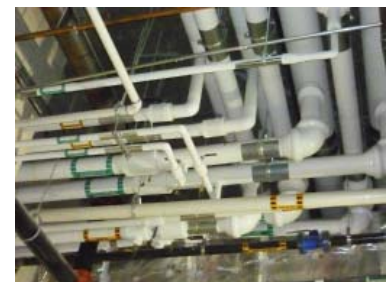
This photo shows the depth of coordination necessary between ourselves, our subcontractors and other specialty trades to install utility piping for domestic hot and cold water, gas, plumbing, sprinkler systems and so forth.

Other key project awards include: U.S Green Building Council's Award of Excellence; Associated General Contractors (AGC) of Washington D.C.'s Washington Contractors Award - New Construction; and AGC's Build America Award, Design-Build - New Construction.